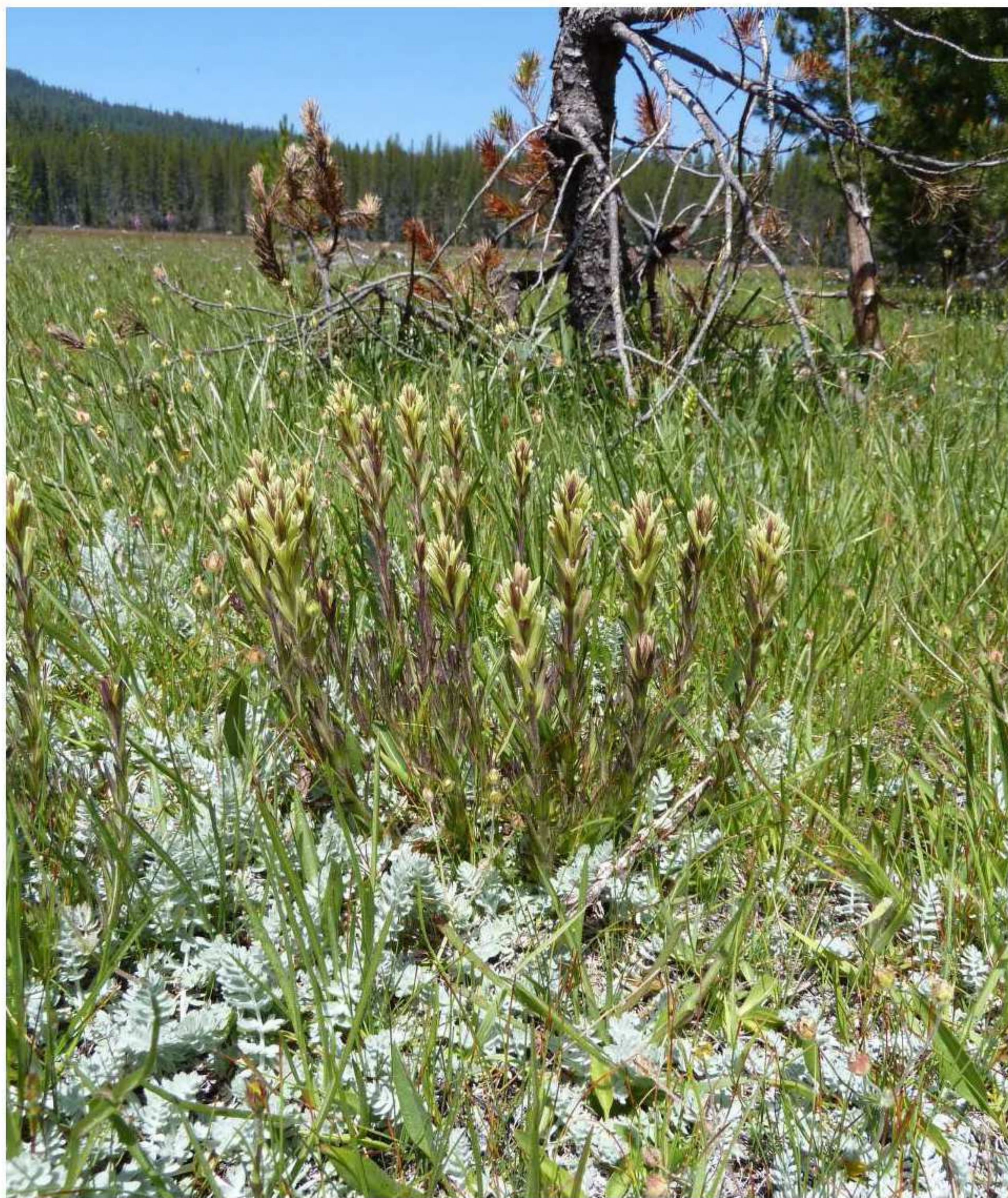
Figure 8. Habitat of Castilleja collegiorum at Big Meadows, with Potentilla breweri , 15 Jul 2013.